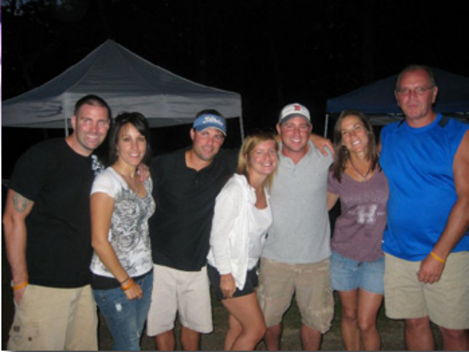
A Labor Day family gathering

Family, friends, honesty and laughter are the focal points in our lives. We often attend get-togethers or cookouts at family and friends homes. We enjoy attending Red Sox games, Patriot Football games, hiking, the beach and many other outdoor activities. At home we love to cook, listen to music and relax in our loft