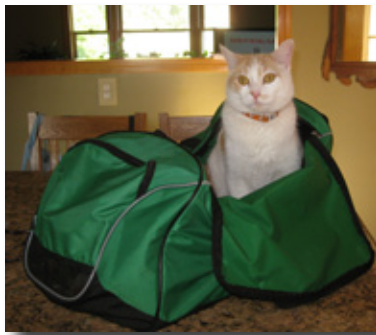
Our cat Mulligan

We have 2 Golden Retrievers; Riley, age 5 and Kali, age 4. They are both rescue dogs who love to curl up on the couch next to us, swim and play ball. Mulligan is our 2 year old cat who seems to enjoy whatever Riley and Kali are doing. At times, we think he's another dog. They all love children and will be very patient and affectionate with a young child.