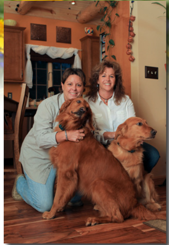
Our dogs Kali and Riley

Our child will be raised to treat others as they would like to be treated. They'll understand the importance of respecting others and being kind to those less fortunate. We'll encourage them to respect themselves as well. We were both raised with our aunts, uncles and cousins around and our child will be raised with family living next door. Family is very important to us and we want our child to feel the love, security and belonging that we grew up with. We are both strong advocates of education and will provide for their college futures. We understand how important it is for a child to know that their college education will be paid for. We're already started saving money so that, when the time comes, our child will have the financial support from us to pursue their passions, vocation and career goals. We want our child to feel confident about reaching towards their dreams. Along with education we will raise our child with a sense of faith and security. We'll provide our child with an opportunity to attend a church with us that is welcoming and loving to all. We hope to raise our child with values that focus on kindness to others and respecting differences in a community.