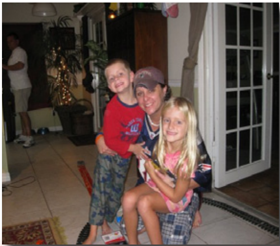
Christmas in Florida with our niece and nephew