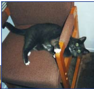
Our cat in a playful mood

As professionals who work for the university, we understand the value of education and how a particularly good education can open life opportunities for our child. We are dedicated to covering the costs of our children's educations and to doing what we can to support their dreams. We, ourselves, continue to develop new areas of interest and learn new things as we engage in our professional lives as teachers and researchers in our fields. We would do all we can so that our child develops the tools to learn and so that they have a good education that will allow her or him to fulfil their potential, in whatever field they desire.