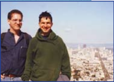
During a visit to San Francisco

We are glad to share more about our relationship and our families. We were legally married 4 years ago in London after gay marriage became legal here. But we considered ourselves married for more than 10 years before that and we celebrate our anniversary in December which was our first date (a movie). We consider ourselves very lucky to have found each other and, now, to have the chance to raise a family together.