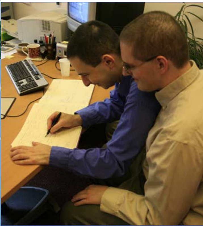
Signing our Civil Partnership