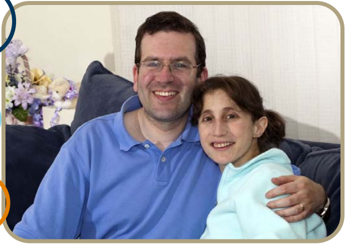
A moment together at home