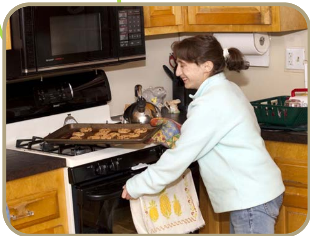
Milk and cookies, a favorite!

We look forward to larger family events as well. Our families will smile from ear to ear upon seeing our child opening up presents during the holidays. We also have a very special family dinner every spring with over 50 family members that's always a joy! We're all usually laughing and chatting too much to actually sit and eat. In fact, we have found every holiday to be a fun time with our family, and we are so excited about the possibility of sharing these moments with our child!