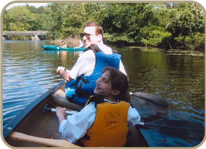
Our first kayaking experience, right on the Charles River