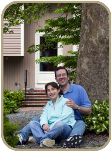
Home sweet home