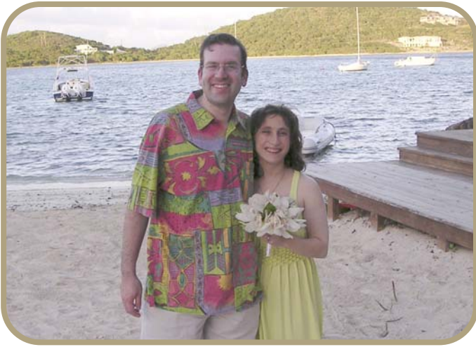
Ready for a beach wedding