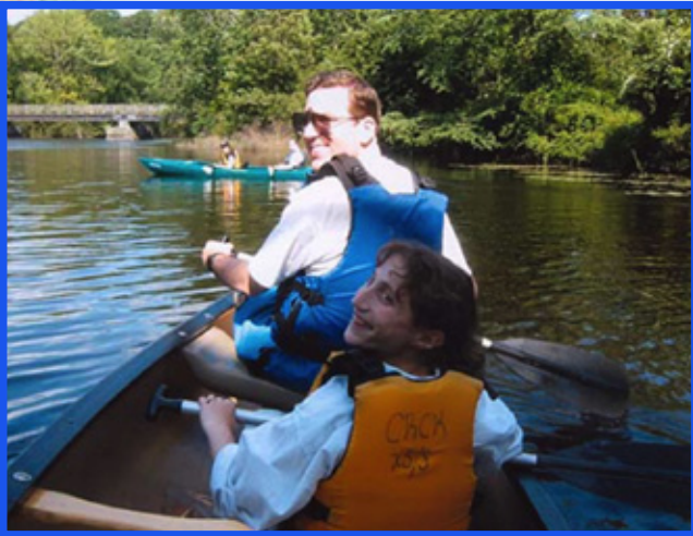
Kayaking on Boston's Charles River