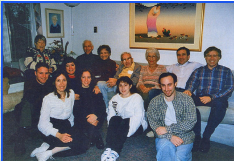
One of our multi-generational get-togethers