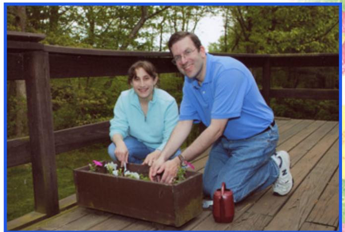
Planting flowers on our deck