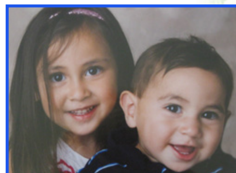
Our wonderful niece & nephew!

also extremely gratifying to help children find their voice and to feel as though they can be better understood by those who love and care for them.