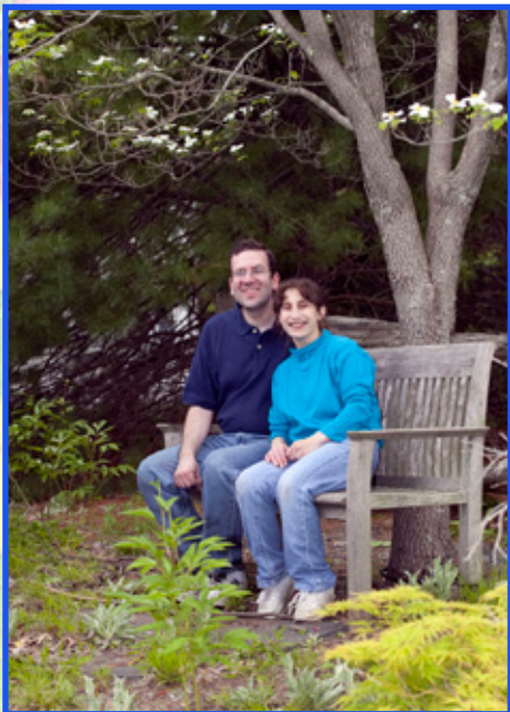
Enjoying our neighborhood park

Our neighborhood is a quiet, safe place to live, and has a highly rated school system. In fact, we chose our location largely because it is such a desirable place to raise a child. Neighbors we have talked to are very happy with the education their children have received, and we have no doubt it will be a terrific place to nurture a child. From its peaceful location, one would think that we're not near anything resembling civilization. However, Boston is only about forty minutes away. We also have several convenient shopping centers nearby, which have supermarkets, retail stores, and restaurants (in addition to one of the best little ice cream places in Massachusetts only 1/2 mile away from us!). We even have a local park, children's museum, zoo, and aquarium nearby that would be such wonderful fun to share with a child! The Boston Science Museum is world class and a spot we're sure to return to so we can enjoy different special exhibits.