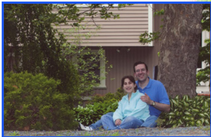
Enjoying springtime in our front yard

We try to be forthright in all our interactions, and we would love to share these values with a child as they learn to interact with and explore the world around them. Our child will be raised to have a belief in God, a loving connection with faith, and a sense of the balance between pursuing individual goals and helping others in the community.