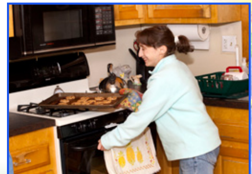
Baking cookies... a favorite! YUM!!!

Our close extended family, including our four parents, our grandmothers, aunts, uncles, brothers, and an adorable niece and nephew are tremendously thrilled and supportive about our plan to grow our family through adoption. They have been unbelievably supportive throughout the adoption process, including taking trips to adoption